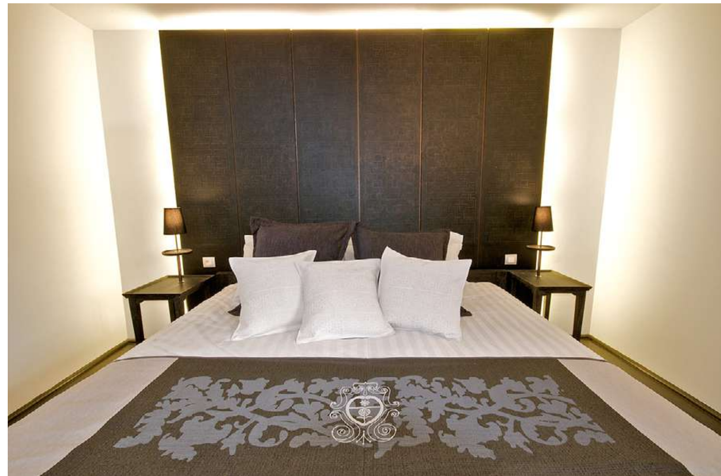
... and second bedroom with charming details