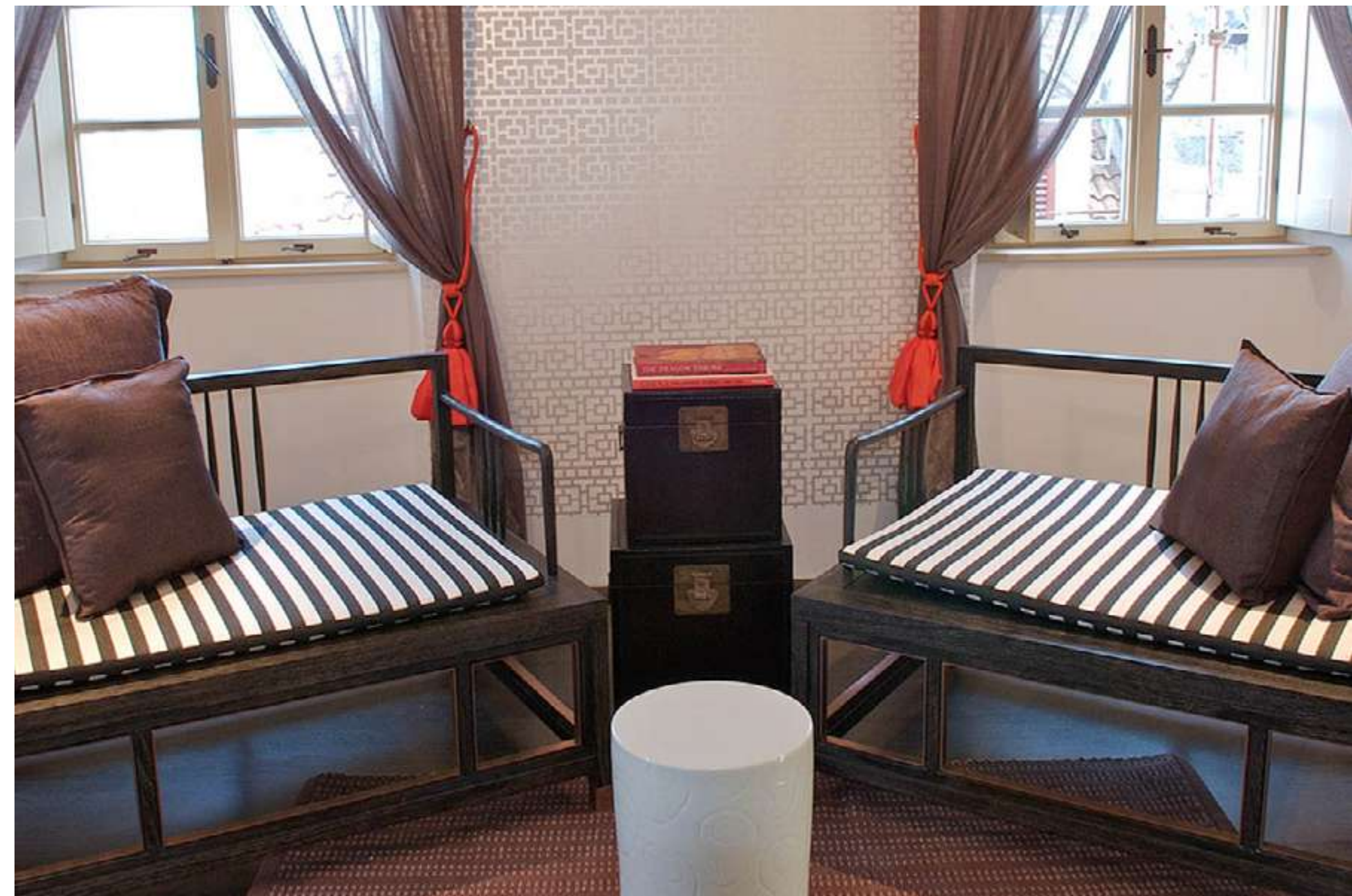
Wonderful and original furniture creates the perfect atmosphere